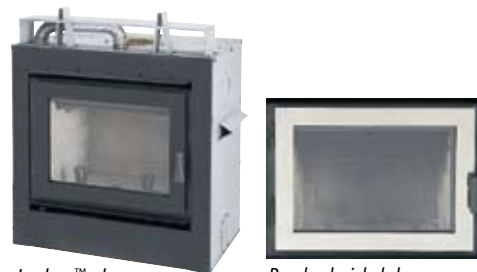
Ladera™ shown with black door

The Dave Lennox Signature™ Collection Ladera™ high-efficiency wood-burning fireplace is a contemporary marvel. Advanced features, like a Double-Air Combustion control, allow you to enjoy a continuous fire without the need for reignites and it helps optimize efficiency. A compact, yet open firebox accepts logs up to 18 inches for large flames, long burn times and additional warmth. And with a clean-face design and expansive viewing area, this EPA-certified fireplace allows you to take pleasure in the modern beauty of an unobstructed fire with a true masonry fireplace feel.