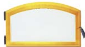
24-carat gold-plated cast-iron door

*Square-foot heating capacities are approximations only. Actual performance may vary depending upon home design and insulation, ceiling heights, climate, condition and type of wood used, appliance location, burn rate, accessories chosen, chimney installation and how the appliance is operated. **Whenever a clean-face panel is used, a gravity kit must be installed.