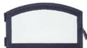
Black-painted cast-iron door