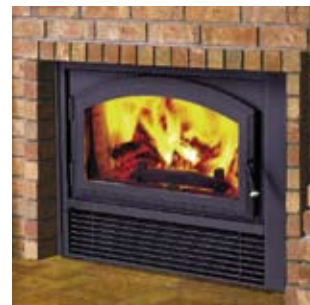
Shown with clean-face panel kit installed